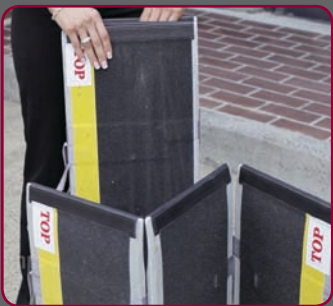
Multi Purpose Model