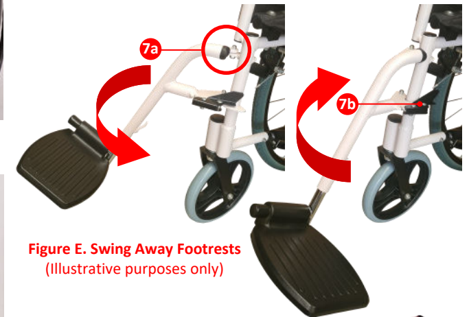
Figure E. Swing Away Footrests (Illustrative purposes only)