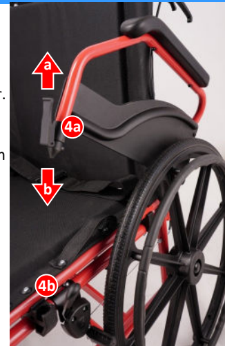
Figure B. Flip Up Armrests

To return armrest to down position, push armpad down until release latch (4a) locks firmly into place (4b).