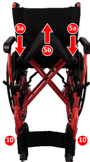
Figure A. Unfolding / Folding

Step 1: Turn up both footplates (10). Step 2: Pull up centre of seat (5b) from the front and rear and fold closed.