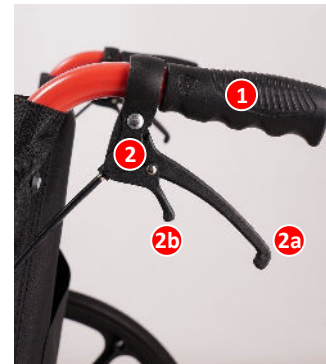
Figure C. Attendant Brake

(Figure C): Squeeze (2a) upward to apply brakes. Release brake lock by pressing in (2b).