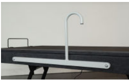
Bed Stick with return