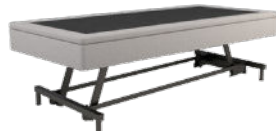
Standard & High Position (>750mm)