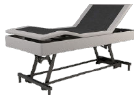
Backrest & Kneebreak in High Position

SIRIUS offers 7 preset positions (including 3 that can be customised to the user), 50 combinations, underbed lighting and a suite of optional additions such as bed stick with return, side rails and an optional matching companion bed.