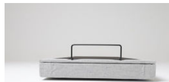
Standard colour: Stone

Optional extras can be purchased and retrofit at any time, ensuring SIRIUS will remain a suitable option for users regardless of their care requirements.