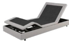
Backrest & Kneebreak in Low Position