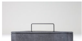
Standard colour: Onyx